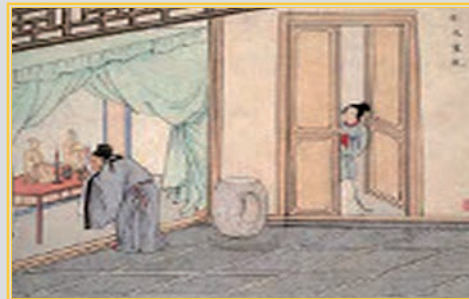
From: THE DREAM OF THE RED CHAMBER [紅樓夢] by CAO XUE QIN [曹雪芹]